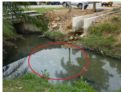
Oil and grease contamination on the river's surface